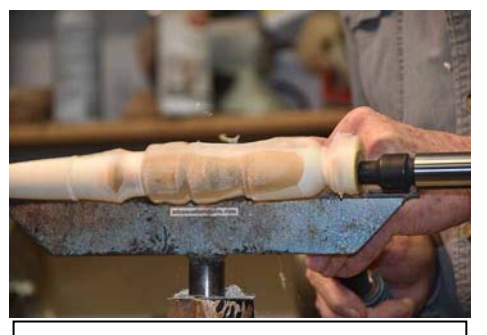
14. Re-mount the workpiece to a point 90 degrees from the 2nd center. This will allow you to turn away one side of the figure. Do the same cut on the opposite side, 180 degrees from the 3rd center.