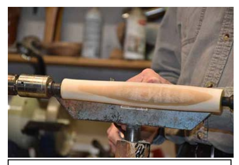
4. Start turning so the workpiece is partially round.