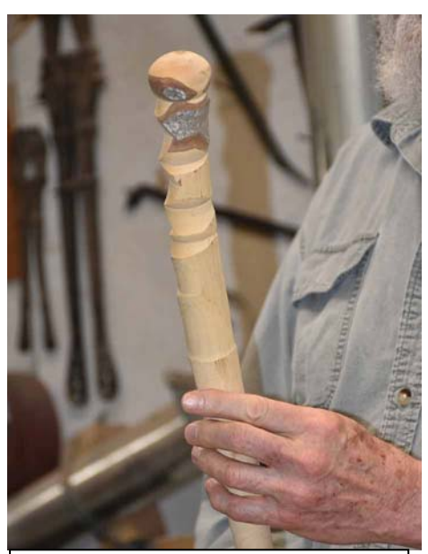
For utility use, the stake doesn't need to be fully smoothed or varnished.