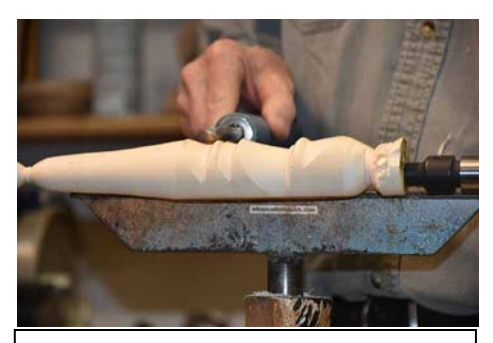
12. A groove at the bottom of the upper lip. Will define the lower lip.