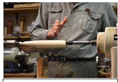
8. Re-mount the workpiece using the 2nd center.