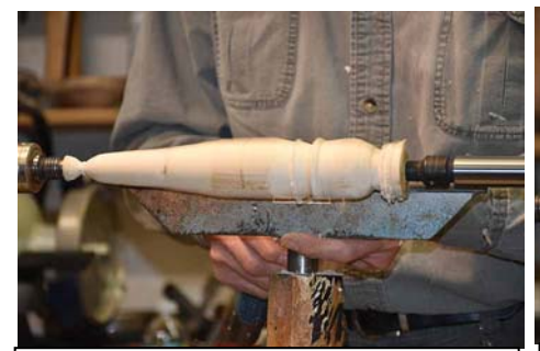
10. Cut a slope up toward the brow. Trim the brow down to the cheek.