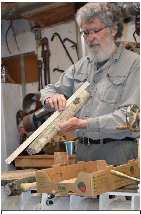
2. Using a straight edge, identify the axis of the stake.