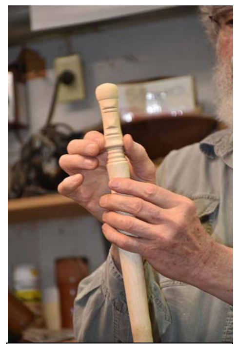
15. This is how the stake will look with both sides trimmed. Excess facial features are trimmed off.