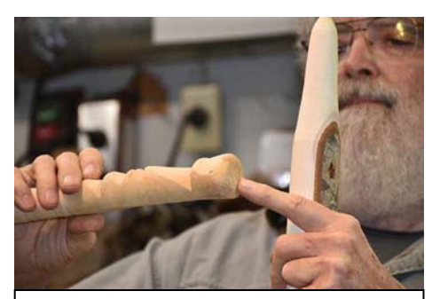
7. Roughly half-way between the real center and the back edge should be the 2nd center, raising the opposite side so you can define the facial features.