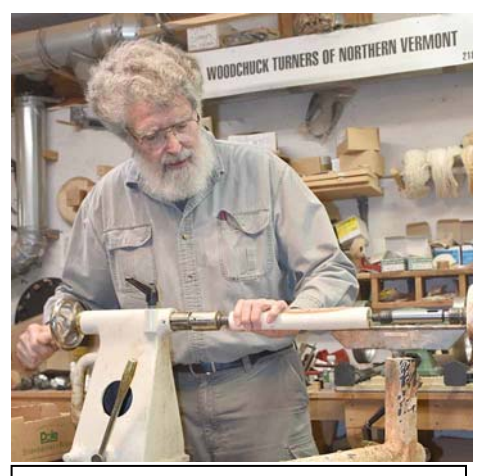
3. Mount the workpiece between centers on the lathe. Dick uses a cup center on each end and adds enough pressure so the tool can cut.