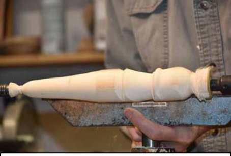
II. Make another short cut up toward where the nose should end. That will define the upper lip.