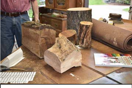
Some of the raffle prizes.

The raffle was held with 10 participants.