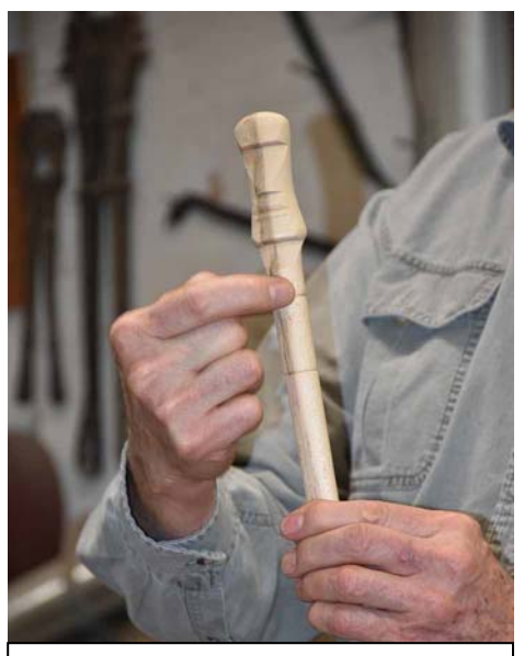
Changing the offset 3 times will allow for a complete set of profiles.