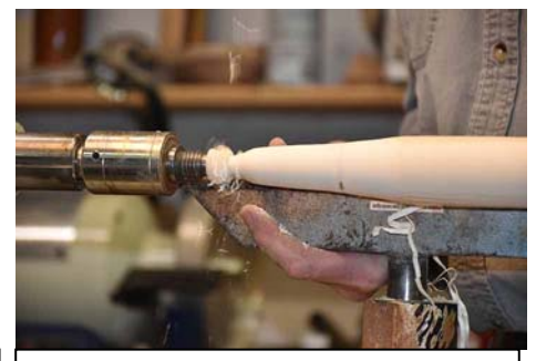
6. Once you have the point defined this much, stop. You need this end to stay mounted until the top half is finished.