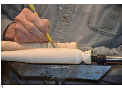
9. Define the top of the stake. Figure and mark the length for the figure's brow, nose, and mouth.