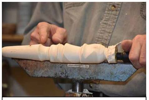
13. One more cut to define the chin.