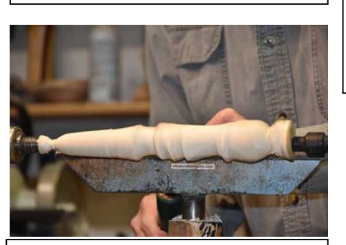
16. The last steps are to get the point final tapered, and to round off the top, removing both mounting points. Sanding will help keep splinters down when the stake is out in the weather.