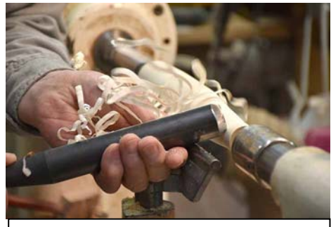
5. Cut a long taper to define the point on the bottom of the stake.